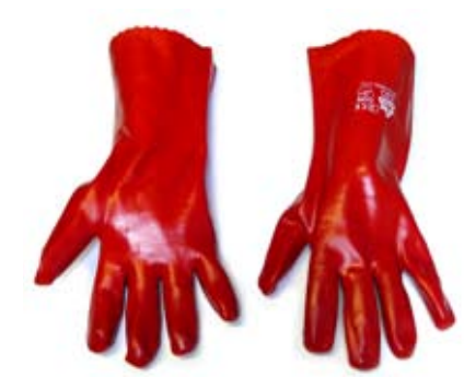
PVC Gauntlet Gloves

14" red, fully coated gauntlet with smooth finish.