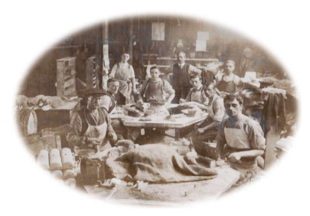
Manufacturing hand-made brushes and brooms at the Clow factory in Glasgow, circa 1920

Established in Glasgow in 1913 as a ladder manufacturer and supplier of tools and equipment to the professional Painting and Decorating Trade, the Clow Group has grown to become one of the UK's largest independent manufacturers and suppliers of Access Equipment and professional Decorating Tools and Accessories.